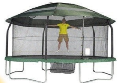
14ft x 17ft Jumping Oval Canopy

To see our full range of canopies please visit