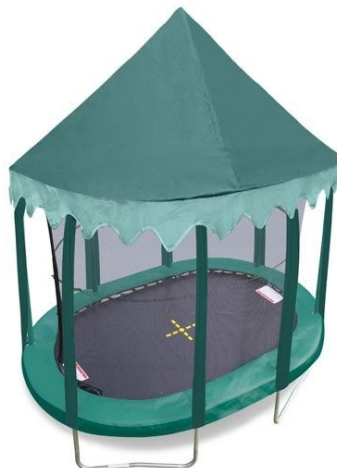
7t x 10ft Oval Jumping Green Tent Canopy