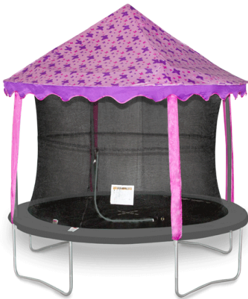
10ft Jumping Butterfly Canopy

Please remember to take the canopy off when not in use and overnight as strong winds and rain may cause it damage - this damage would not be covered under warranty.