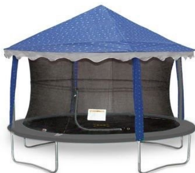
7ft x 10ft Jumping Oval Star Canopy