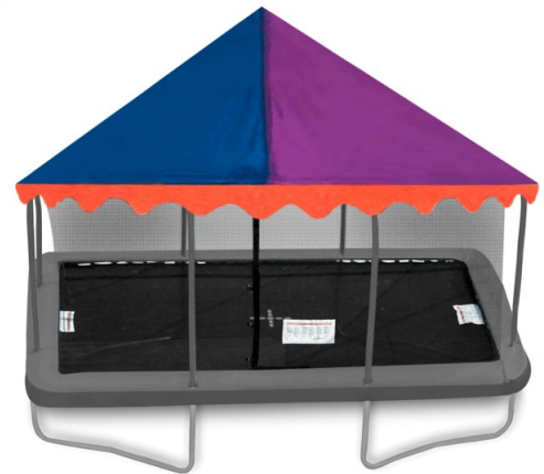
6t x 9ft Rectangular Jumping Circus Canopy